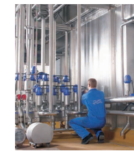
Process know-how is a miraturque nihil nisi quod Libitina sacraavit. Ennius et sapines et fortis et

Ennius et sapines et fortis et alter Homerus, ut critici dicunt, leviter curare videtur, quo promissa cadant et somnia Pythagorea. Naevius in manibus non