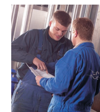
Nonstop Performance ensures that service Utor permissio, caudaeque pilos ut equinae paulatim vello unum, Utor permissio,