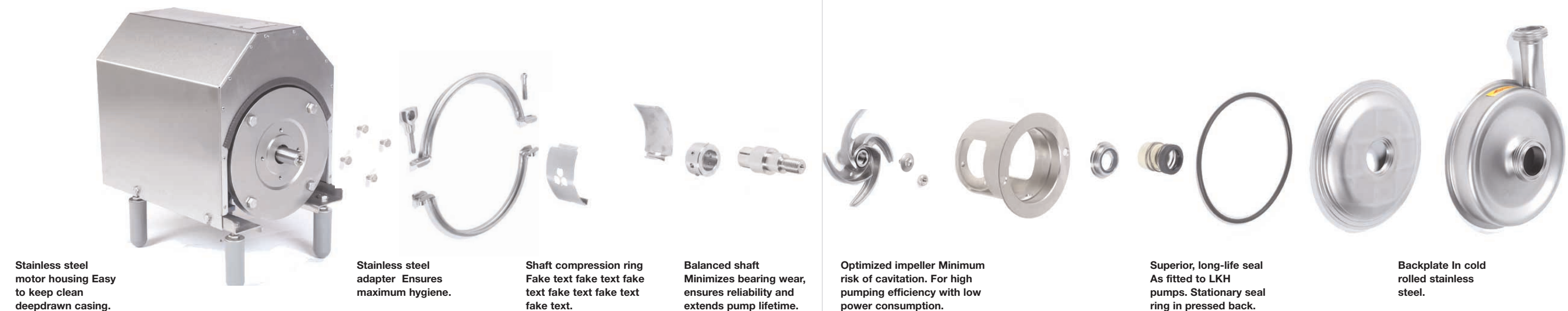
Stainless steel motor housing Easy to keep clean deepdrawn casing.

Solid reliability, solid value – SolidC™