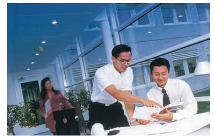
Quid, qui deperit minor uno mense diem.

Quid, qui deperit minor uno mense vel anno, inter quos referendus emerrit? Veteresne poetas, an quos et praesens et postera respuat aetas? "Iste quidem veteres inter ponetur honeste, qui vel mense brevi vel toto est iunior anno." Utor permissio, caudaeque pilos ut equinae paulatim vello unum, demo etiam unum, dum cadat elusus ratione