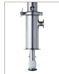
Toftejorg SaniMidget Retractor