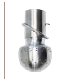
8000 Series Spray Balls