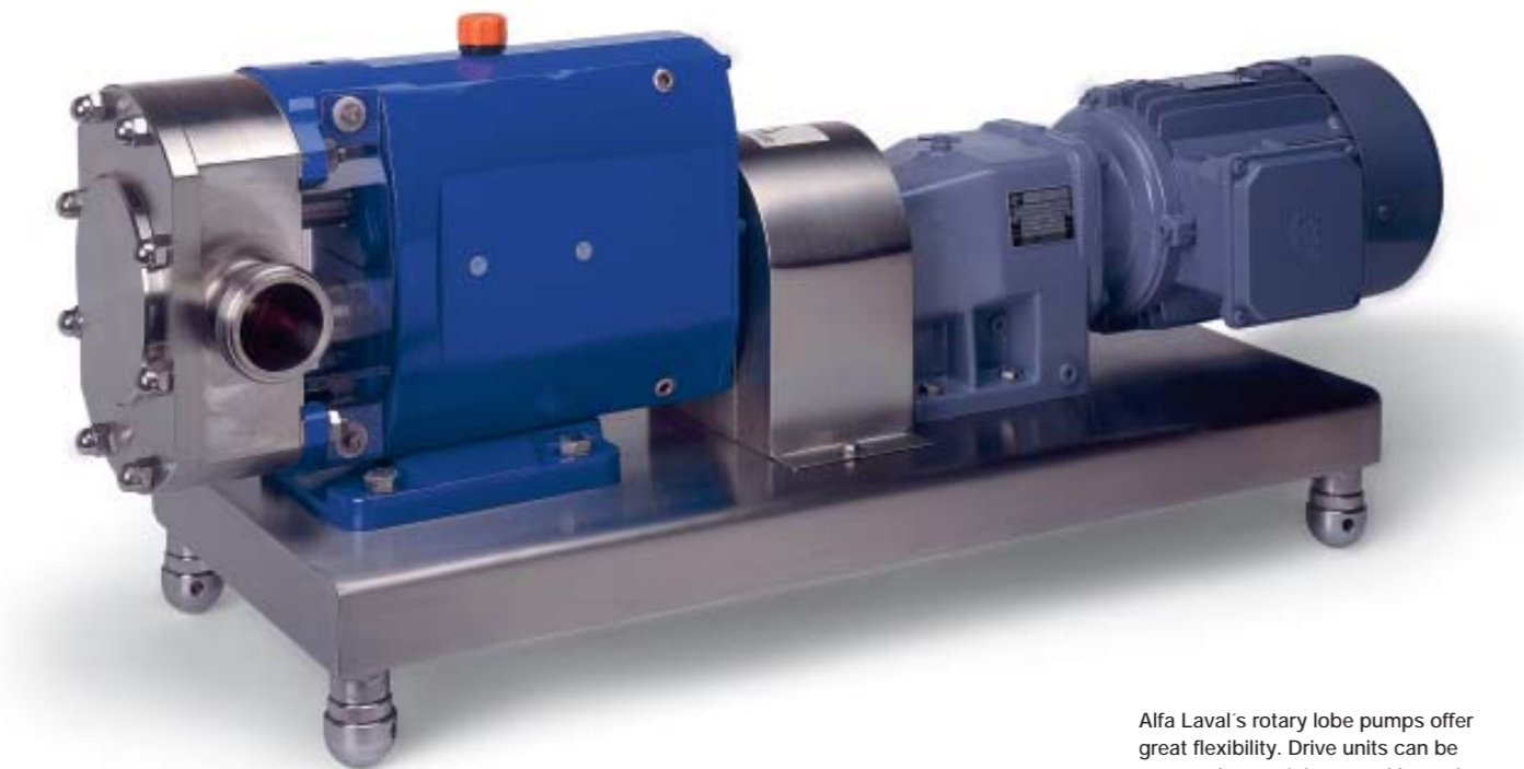
Alfa Laval's rotary lobe pumps offer great flexibility. Drive units can be mounted on stainless steel baseplates or mobile trolleys depending on application needs.

In this brochure you will find an overview of the Alfa Laval SRU and SX rotary lobe pumps. For technical specifications and details, please refer to our product data sheets provided by your local Alfa Laval supplier.