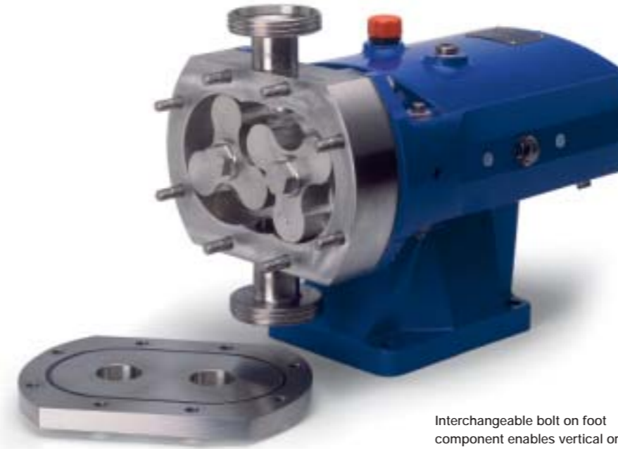
Interchangeable bolt on foot component enables vertical or horizontal port configuration.