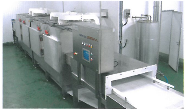
▶ Microwave tunnel TMW 150