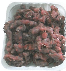
Grinding at -4 °C/-2 °C after microwave tempering