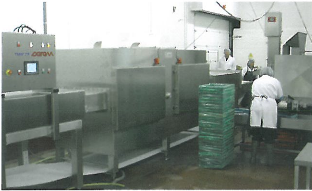
▶ Microwave tunnel TMW 75