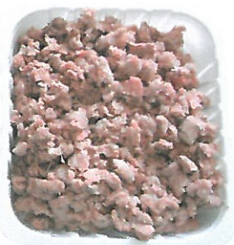
Grinding at -20 °C without microwave treatment