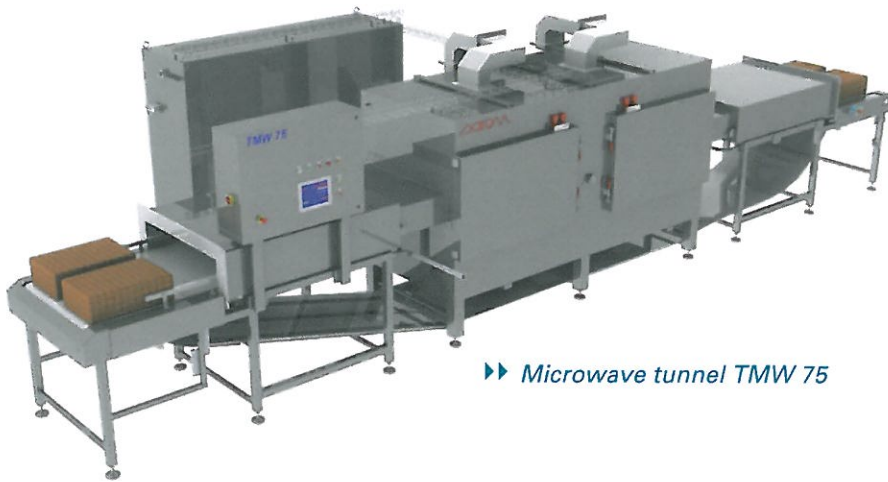
▶▶ Microwave tunnel TMW 75